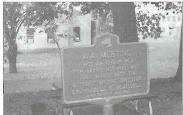
Plaque at the entrance to hospital grounds.