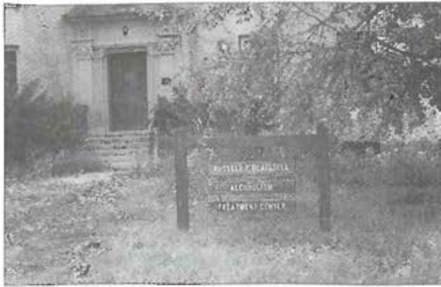
The Russell E. Blaisdell Alcoholism Treatment Center, where meetings were first held, is no longer in use.